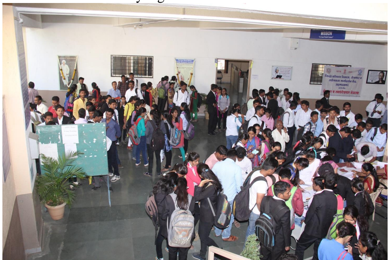
Job fair organized by IBMRD with collaboration with Government Employment Office Ahmednagar on 27<sup>th</sup> Feb 2017