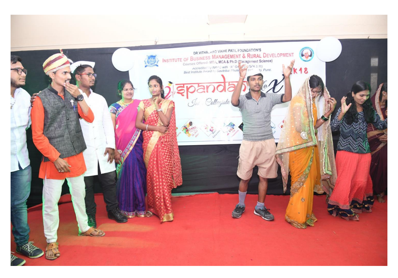
Spandan Mex / Dance Commpetition