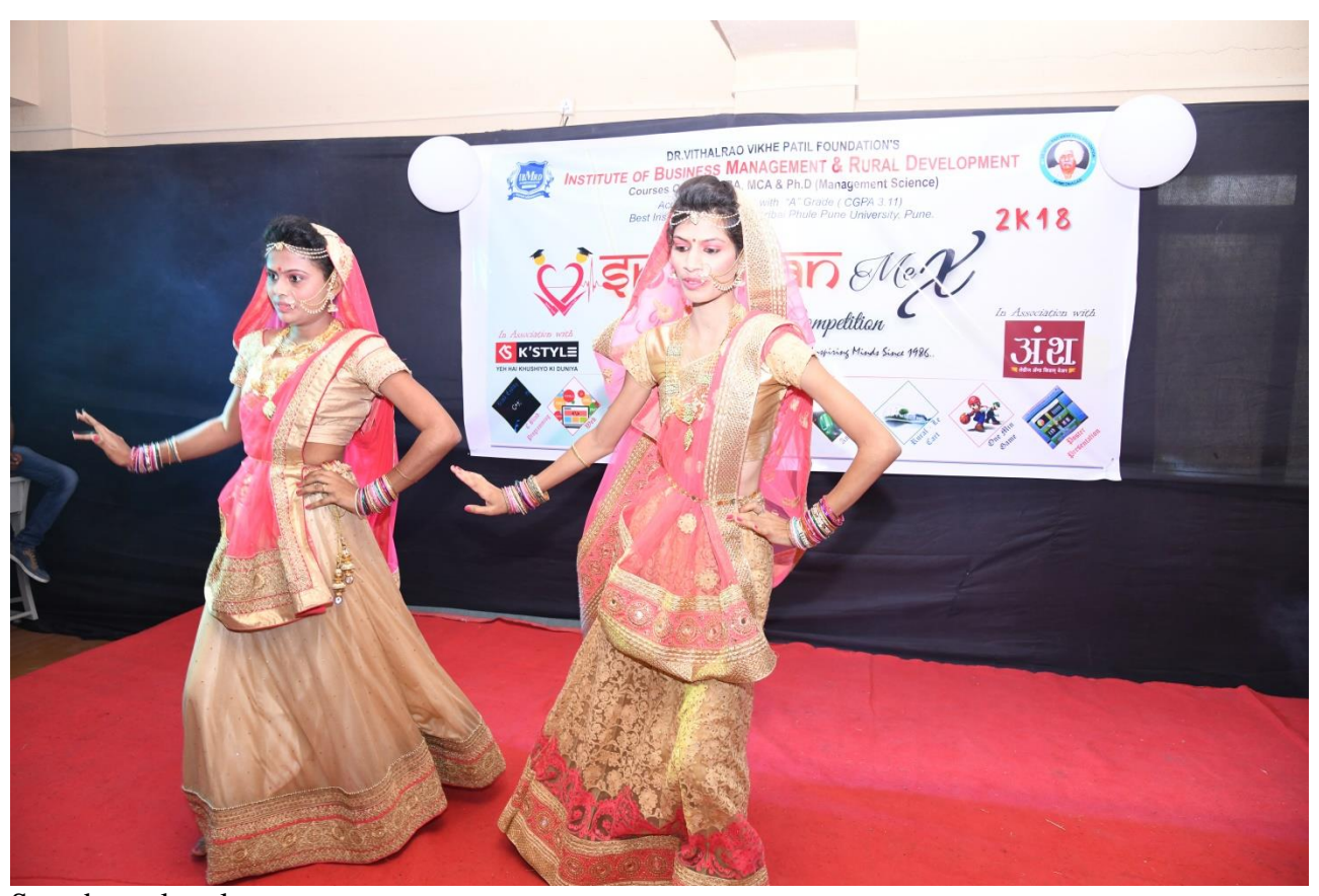
Spandan cultural programme