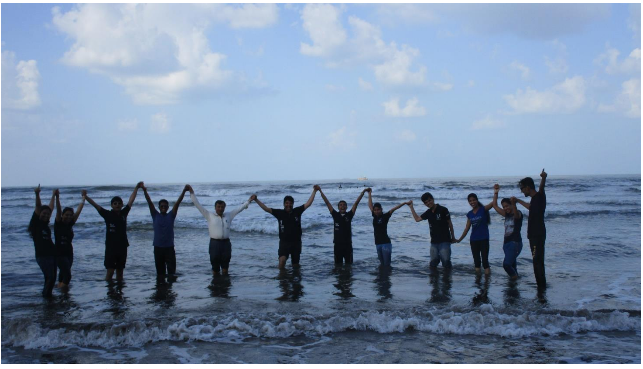
Industrial Visit at Harihareshwar