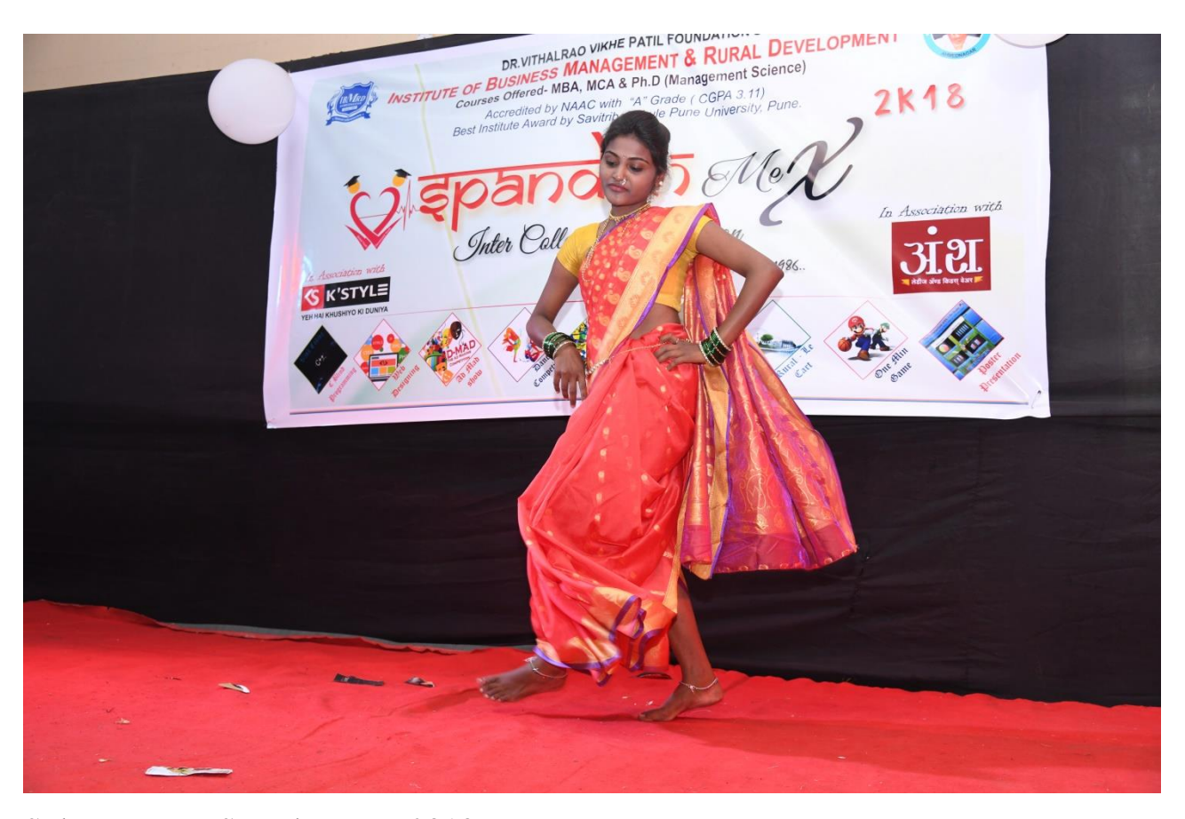
Solo Dance at Spandan Mex 2018