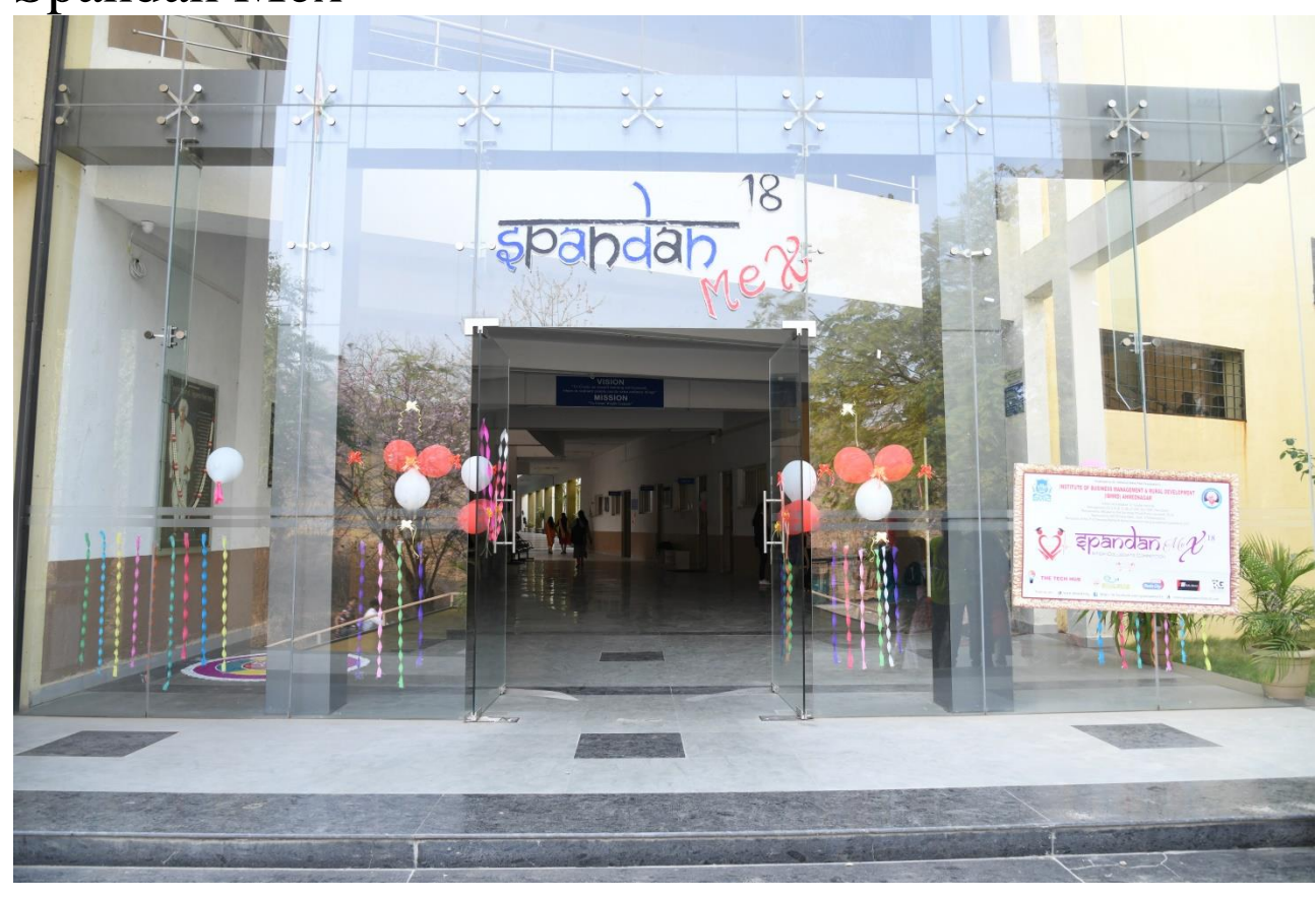
Spandan Mex Innouguration