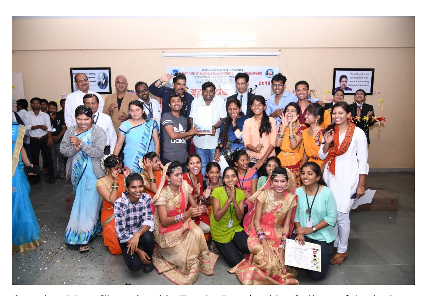
Spandan Mex Championship Trophy Received by College of Agriculture Ahmednagar ViladGhat