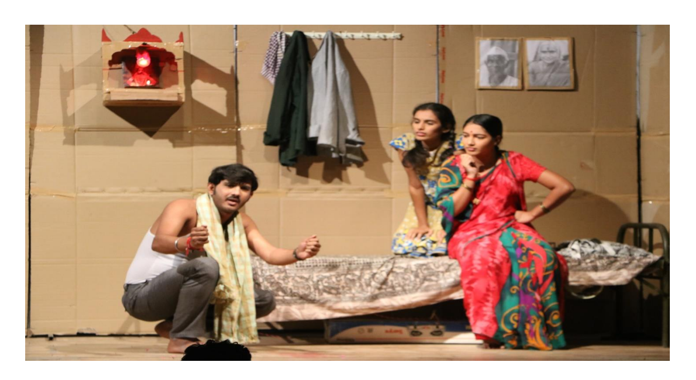
One Act Play Driver performed by IBMRD at Shahu Modhak Intercollege Competition.