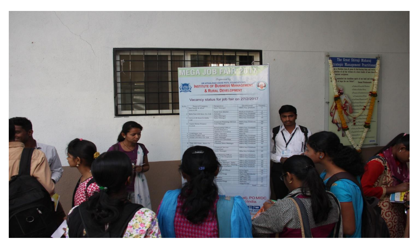
Job fair organized by IBMRD with collaboration with Government Employment Office Ahmednagar on 27<sup>th</sup> Feb 2017