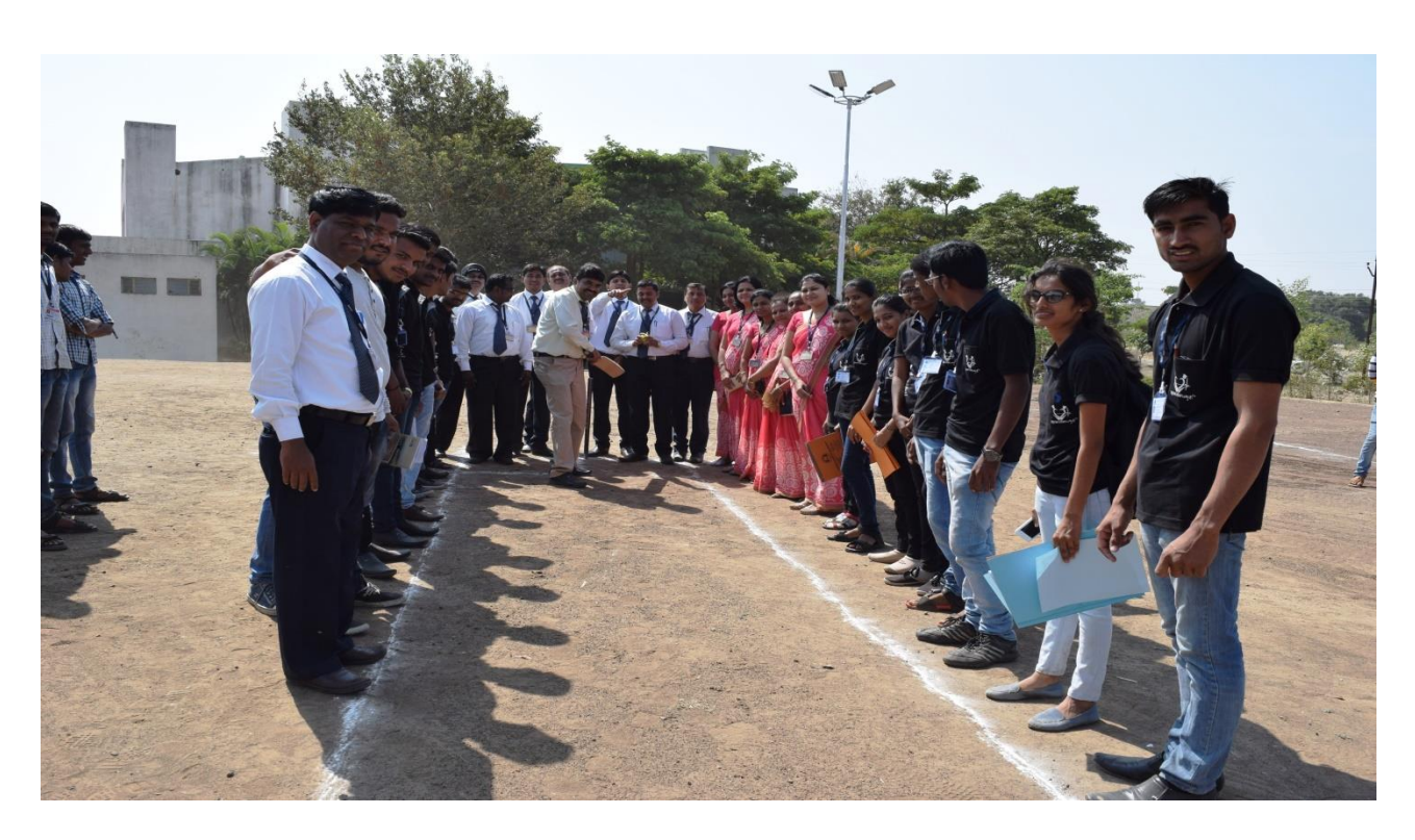
Spandan Mex Cricket Competition Innoguratation